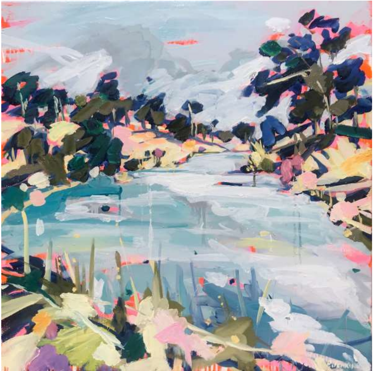
Macdonald River I

SOLD Oil on canvas framed in a pale oak box frame, 72 x 72cm