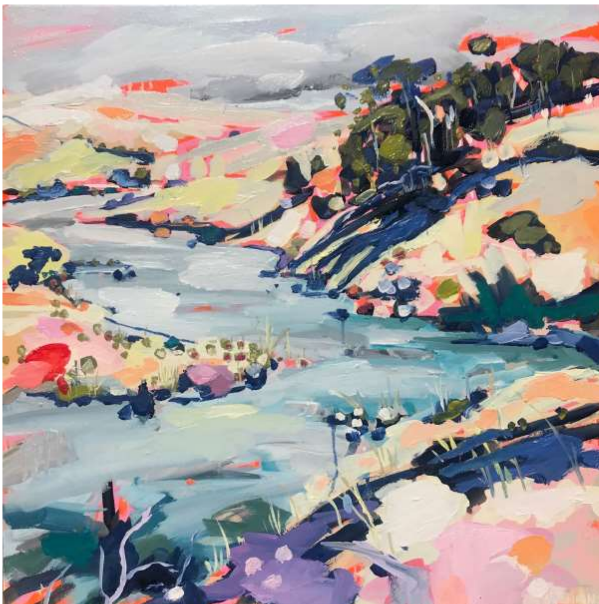
Macdonald River II

$1,800 Oil on canvas framed in a pale oak box frame, 72 x 72cm