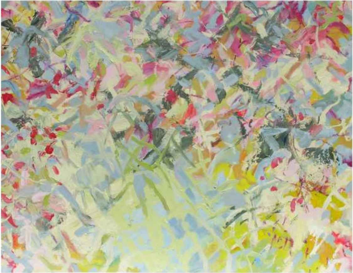
Trip the Light