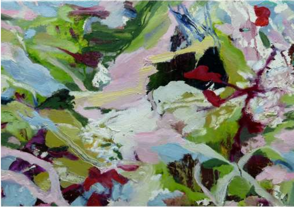
Day Dream Believer