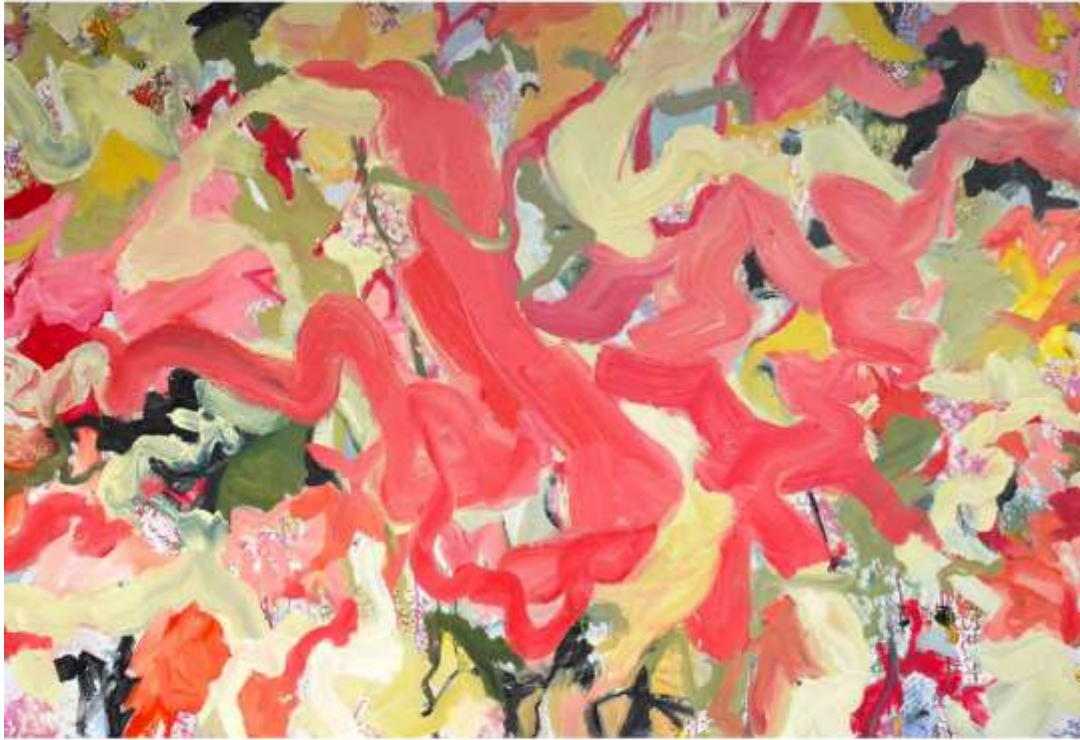
Force of Nature