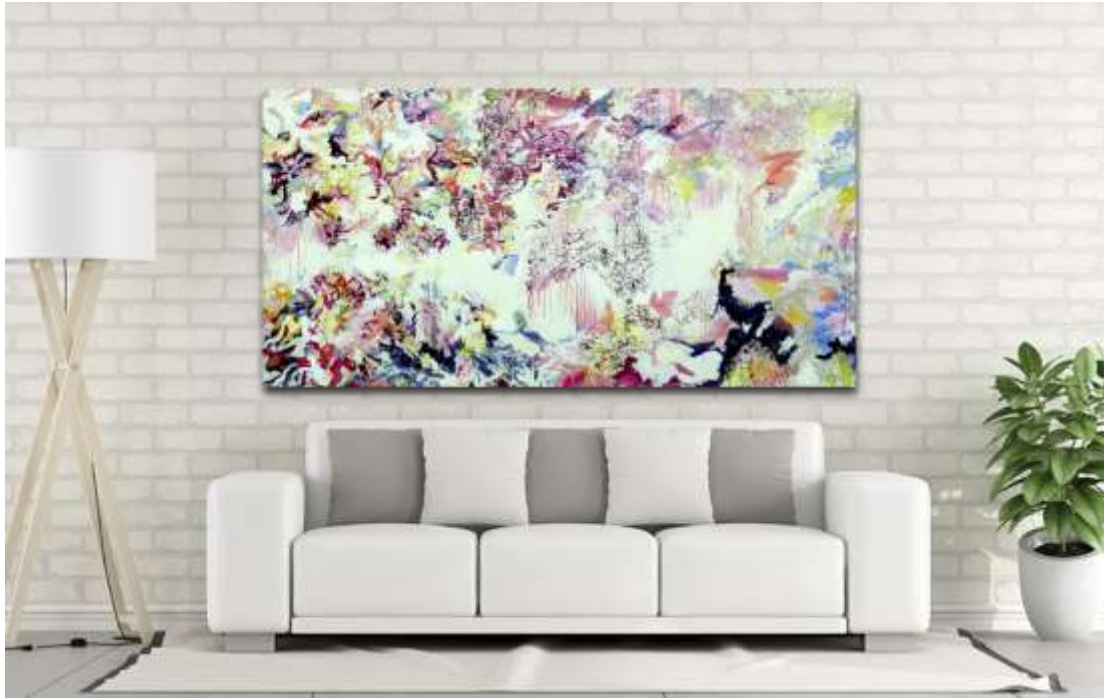
Fall of Grace

$5,930 Oil and acrylic on canvas, 100 x 200cm