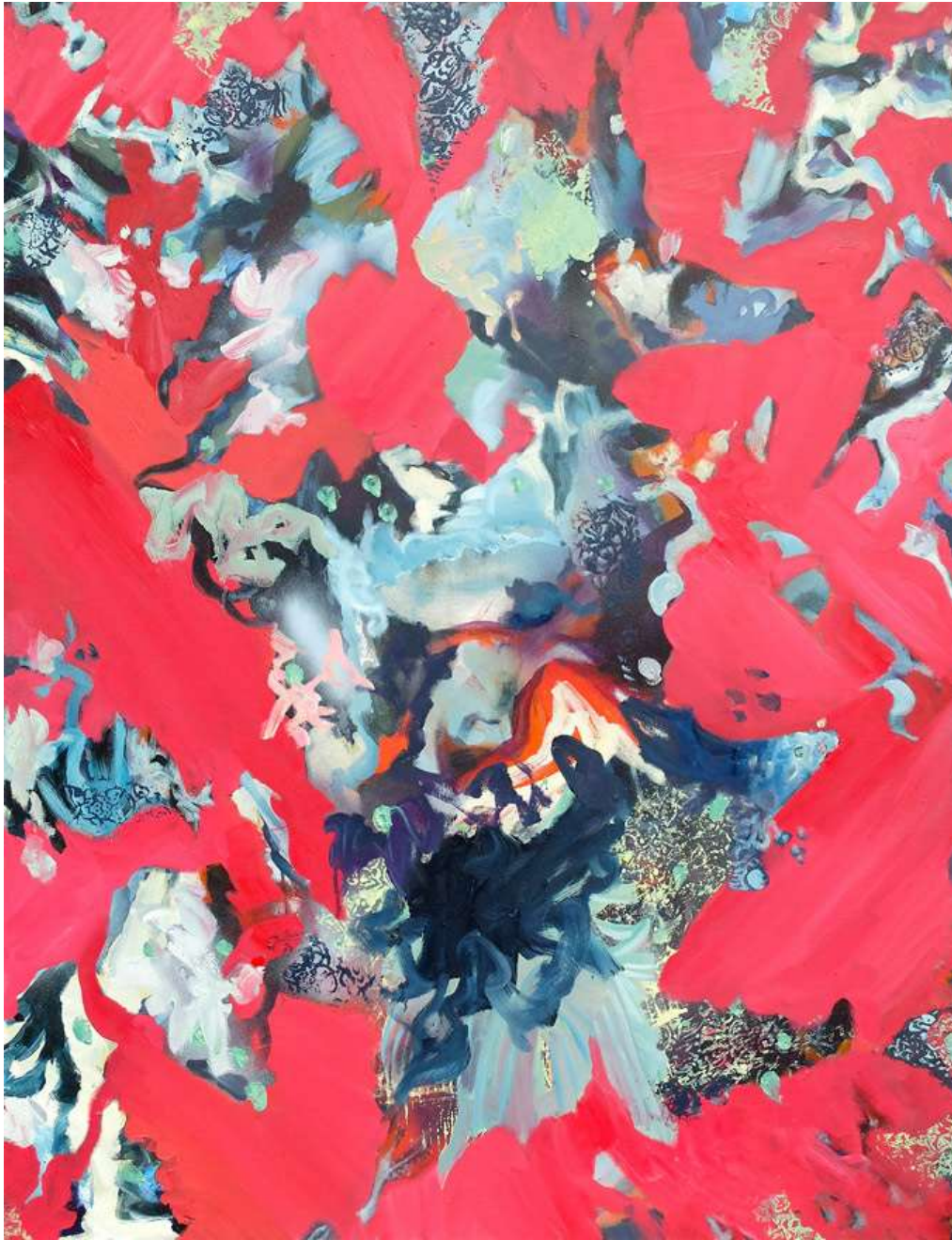
The Other Side