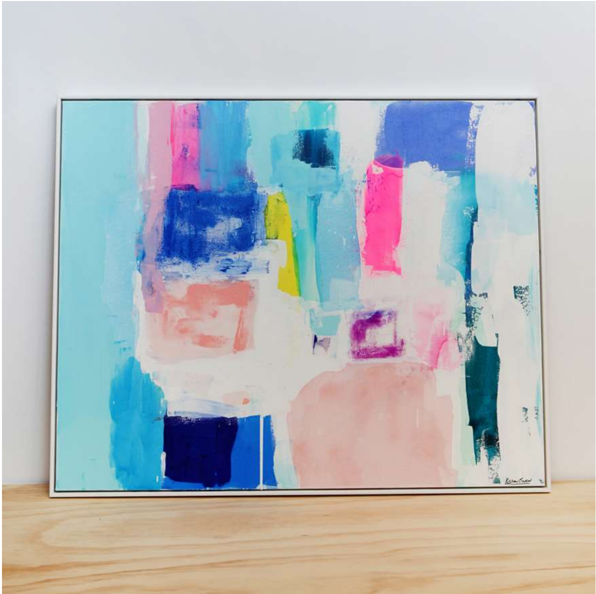
Summer Love Series #3

SOLD $2,990 Mixed media on canvas in white inset frame, 122cm x 152cm