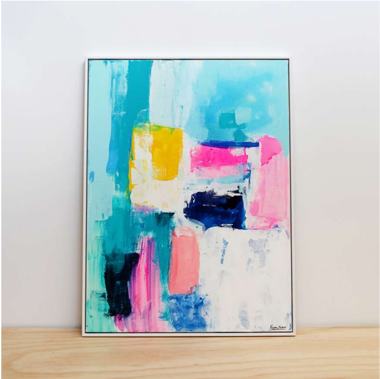
Summer Love Series #2

SOLD $2,490 Mixed media on canvas in white inset frame, 123cm x 93cm