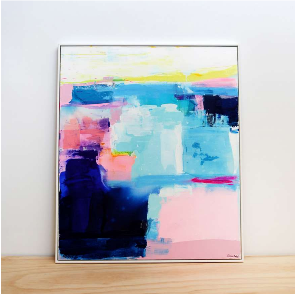
Shades of Summer

SOLD $2,890 Mixed media on canvas in white inset frame, 133cm x 113cm