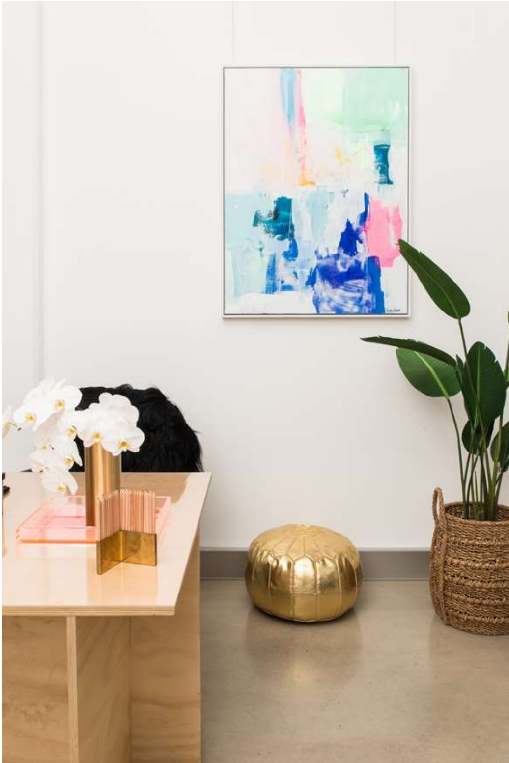
Amalfi Coast at Piccolo PR