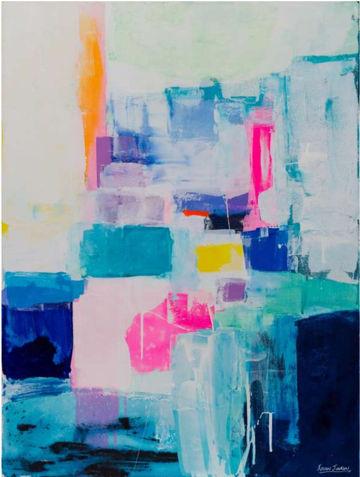
Love Me Now

$2,490 Mixed media on canvas in white inset frame, 123 x 93cm