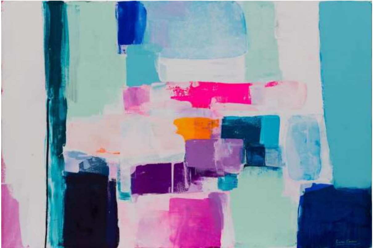
Kissed with Love

$2,990 Mixed media on canvas in white inset frame, 102 x 152cm