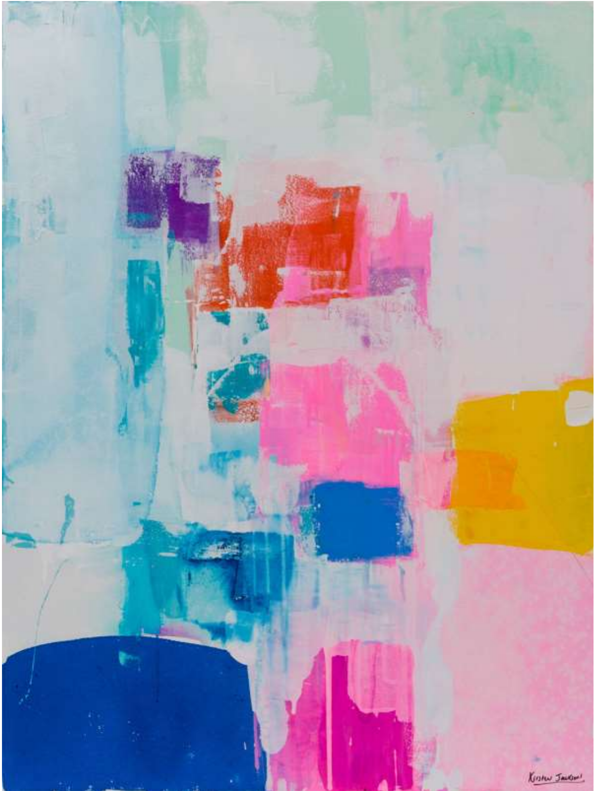
Love Will Set You Free

$2,490 Mixed media on canvas in white inset frame, 123 x 93cm