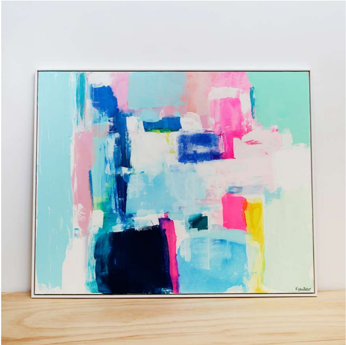
Summer Love Series #1

SOLD $2,990 Mixed media on canvas in white inset frame, 122cm x 152cm