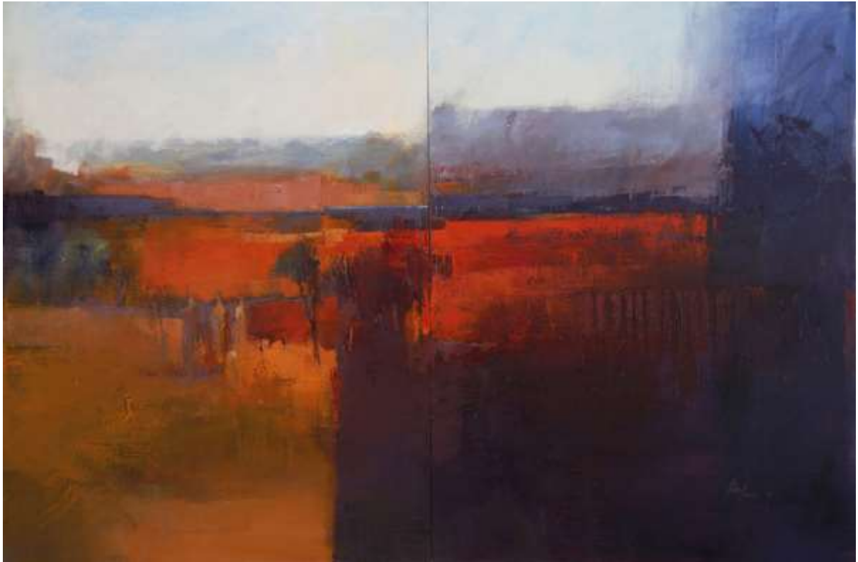
Wandering Through Autumn Diptych