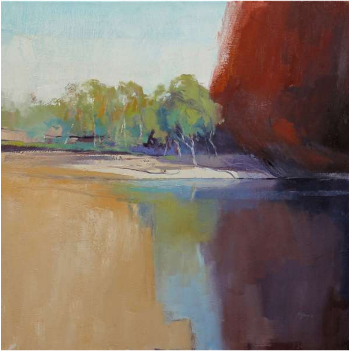
Reflecting Ormiston Gorge