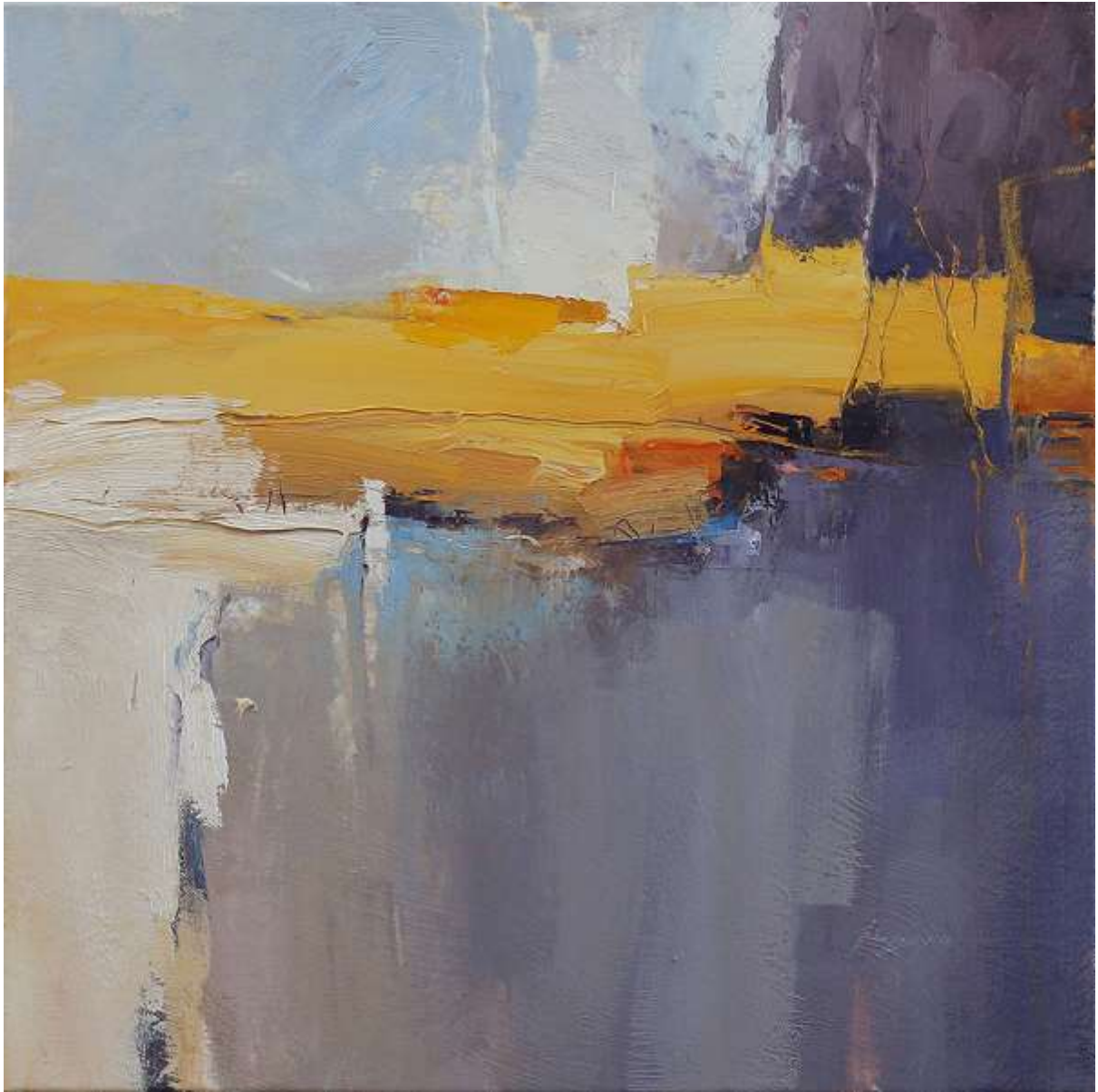
Across the Lake