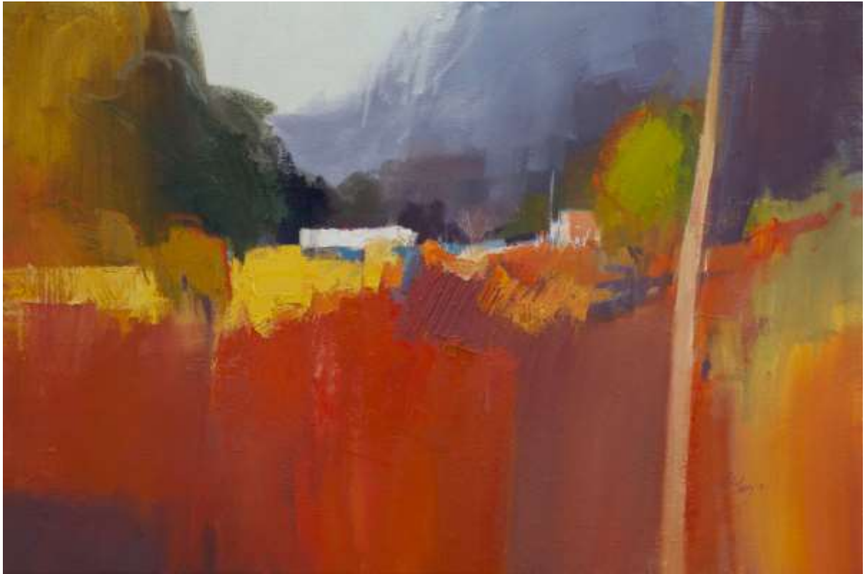
Change of Season