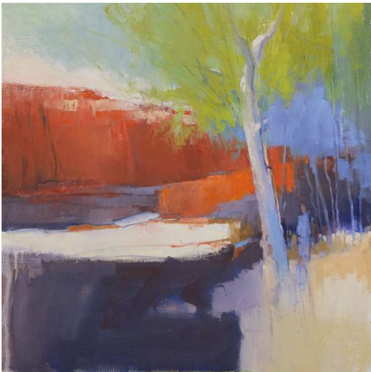
Colours of Ormiston Gorge