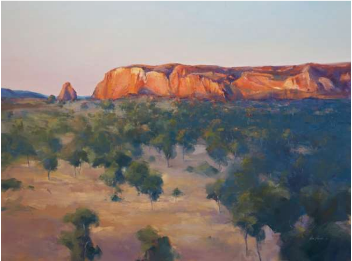
North Bungles Sunset