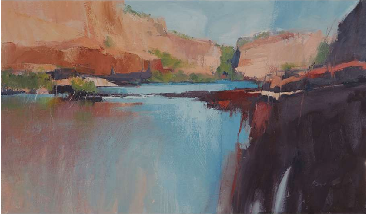
Transition Katherine Gorge 2