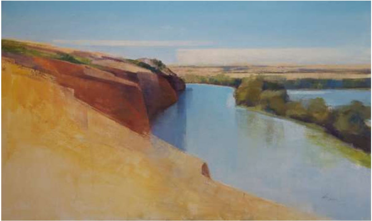
Near Teal Flat