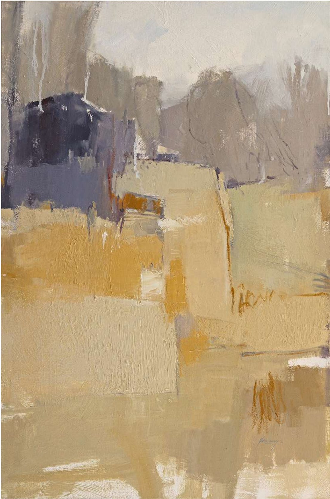
Winter's Ochre Light