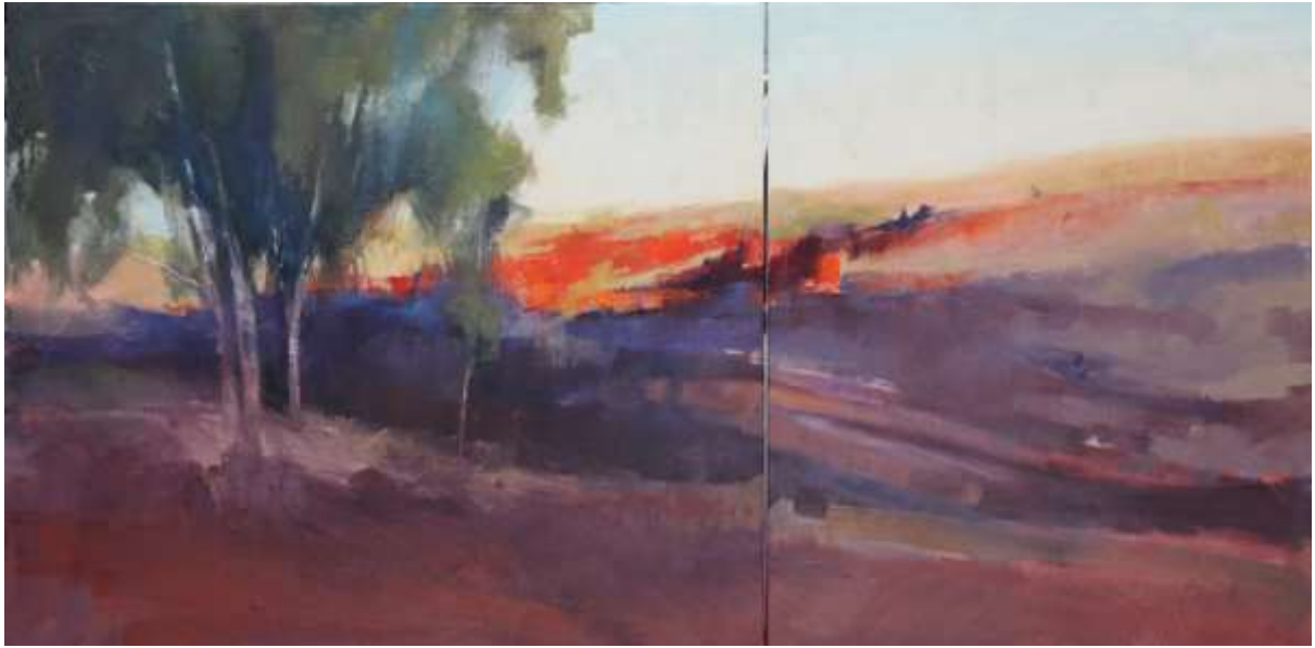
Dales Gorge Sunset Diptych