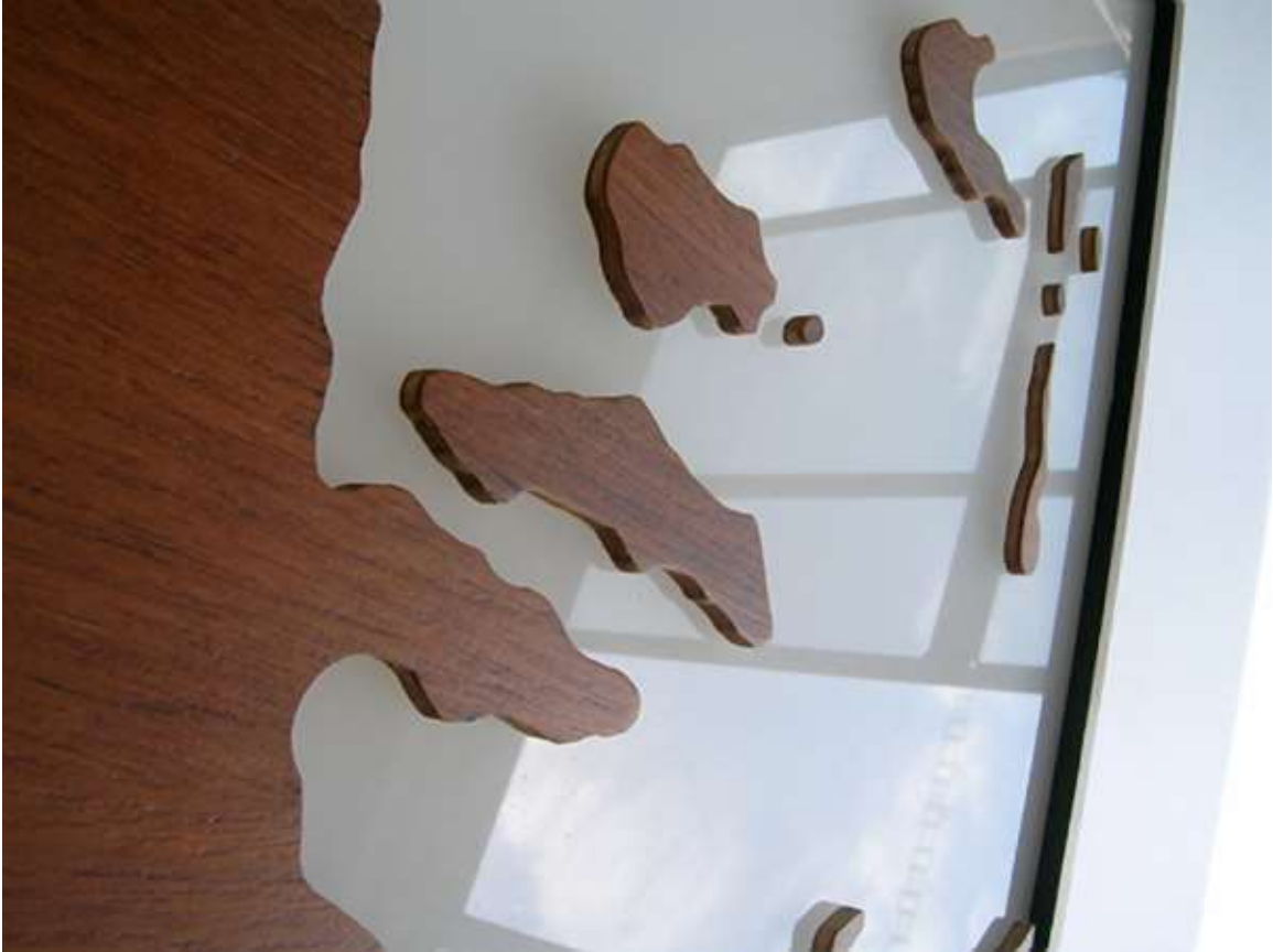
Surface contrast detail