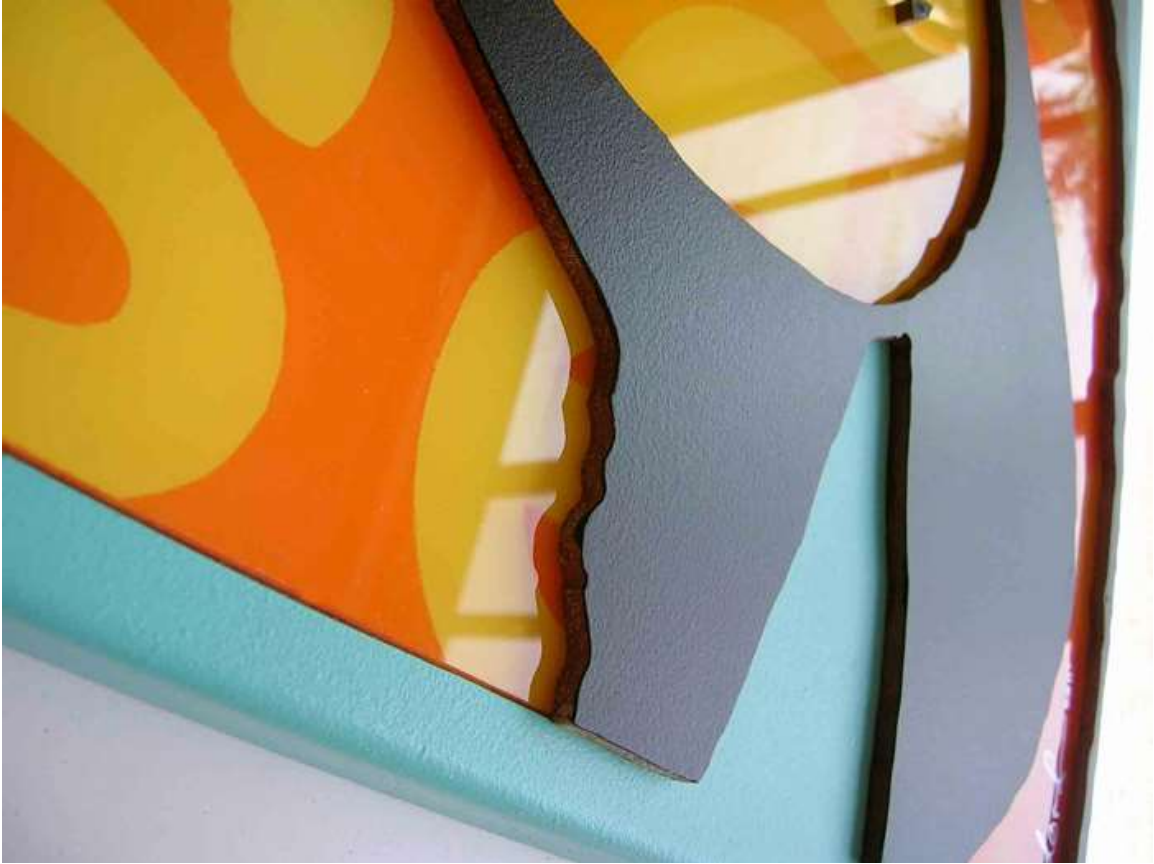
Surface contrast detail