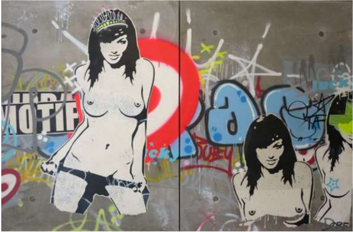
Urban Motif Diptych

$11,800 Mixed media on lightweight composite concrete panel 8cm thick, 122cm x 185cm