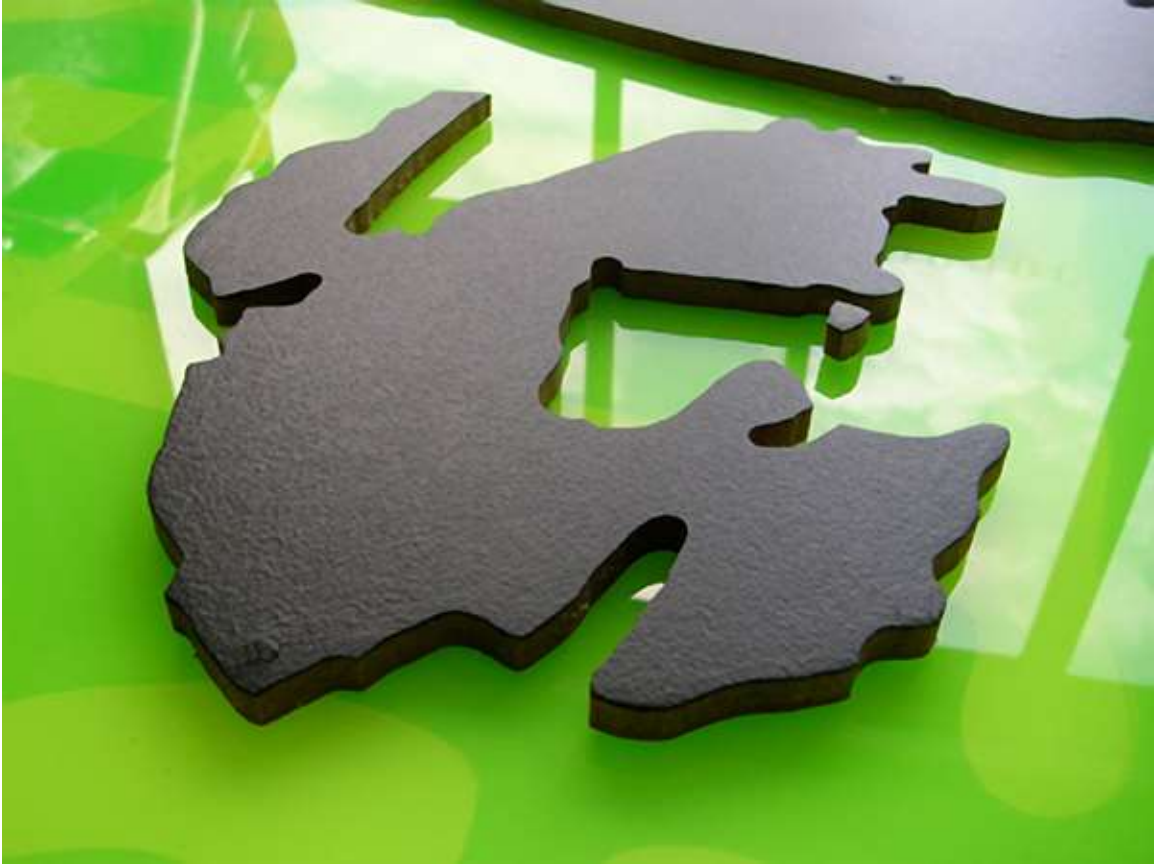
Surface contrast detail