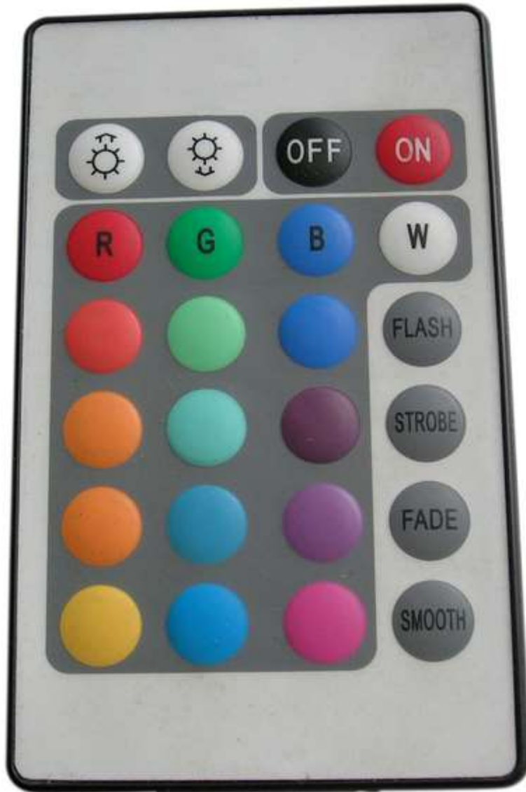
Interactive lightbox IR remote control allowing colour & special functions to be changed