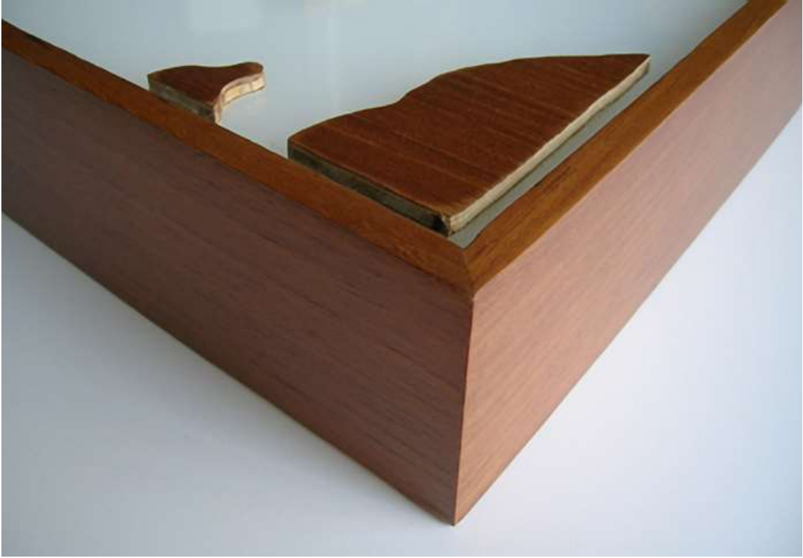
Teak edge detail