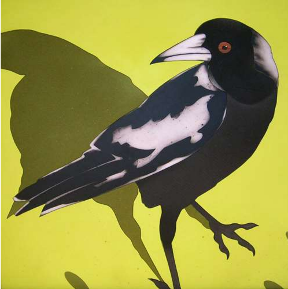
Domino - 2011 Mosman Art Prize finalist