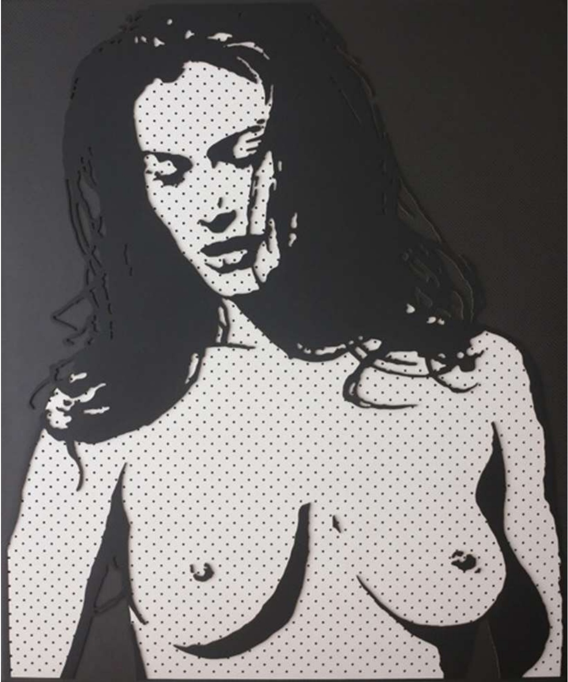
Stark Contrast 2

$7,500 carbon fiber, wood, masonite & acrylic, 122cm x 102cm